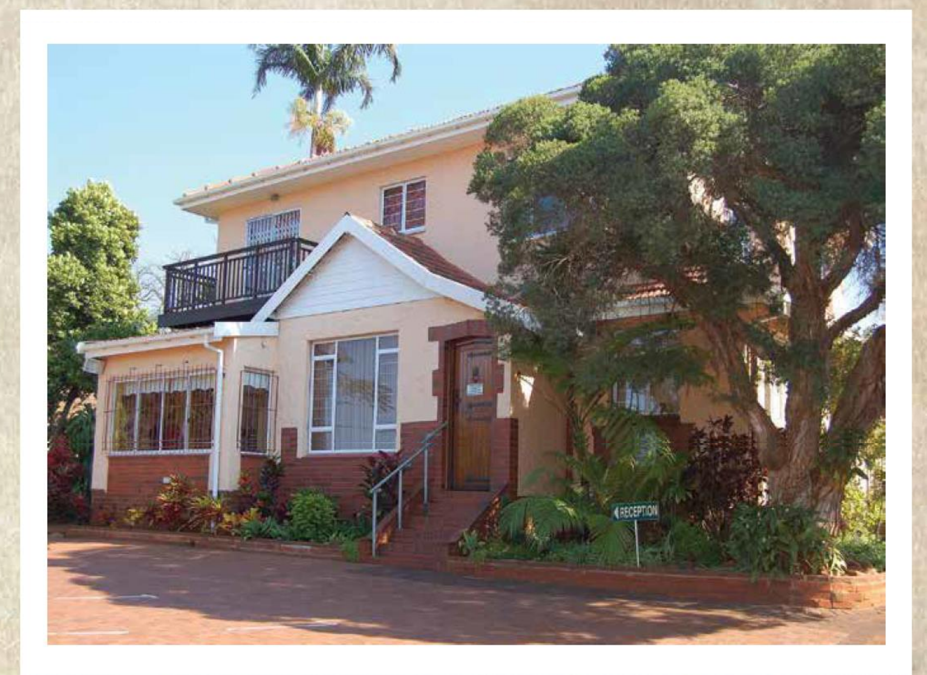
ATTORNEYS, NOTARIES & CONVEYANCERS